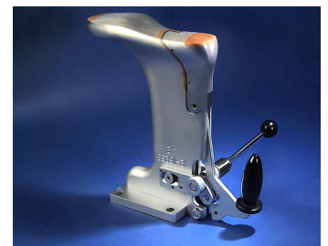
4. Assembly of last