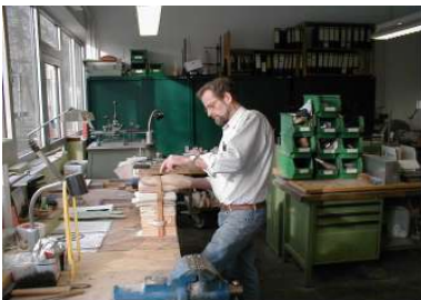
1. last Modelling