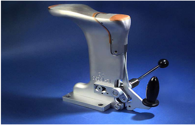
Production last with lasting support

Especially lasting of uppers for heavy footwear is causing increased wear and tear on the production lasts. In order to reduce this and to make it easier for the operator a “lasting support” was developed in cooperation with our customers.